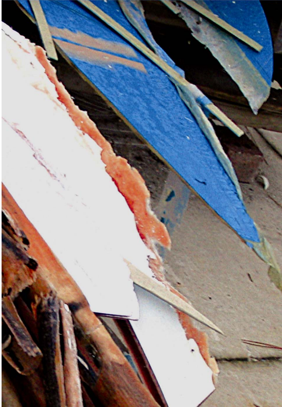
Figure 4. Waste Composite Scrape Suitable for Mechanical Recycling