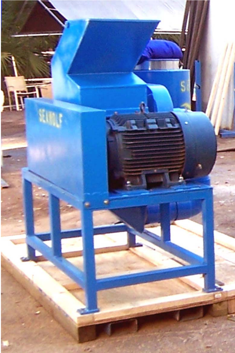
Figure 1. 16-inch Grinder/Muncher from Seawolf Industries